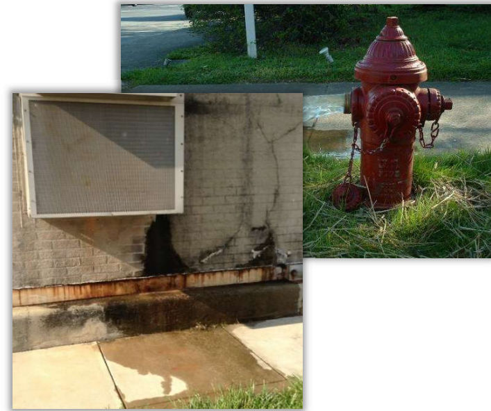
Table 2. Discharges not typically considered as illicit discharges.

There are some discharges not considered as illicit unless Reynolds identifies them as a significant contributor of pollutants. Allowable discharges, as listed in Table 2 , may not be easily identified as the source of a flow within the storm sewer. These flows can occur during dry weather, indicating a potential illicit discharge and resulting in an investigation to determine the source may be necessary. If the source is unknown, it should be reported to the Reynolds Buildings and Grounds Manager. Reporting contact information is also provided on the Reynolds stormwater webpage . Procedures for investigating the source of an illicit discharge are further described in Section 2.5 of this Handbook.