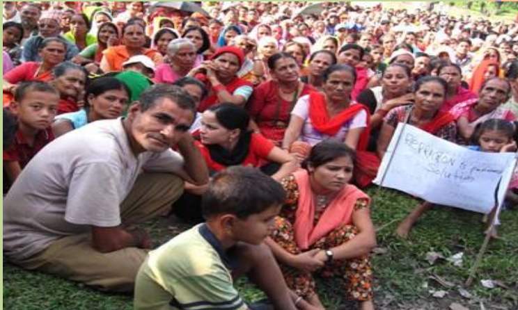
Bhutanese Refugees in Nepal

Bhutan is located between India and China. Since 1991 over one sixth of Bhutan's people have sought asylum in Nepal, India and other countries around the world. The majority of these refugees are Lhotshampas, one of Bhutan's three main ethnic groups. This group was forced to leave Bhutan in the early 1990s. Over 105,000 Bhutanese have spent more than 15 years living in refugee camps established in Nepal by the United Nations High Commission for Refugees. Others are living outside the camps in Nepal and India, and some have gone to North America, Europe and Australia. . ( www.photovoice.org/bhutan .)