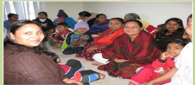
Bhutanese Refugees in Dallas Texas