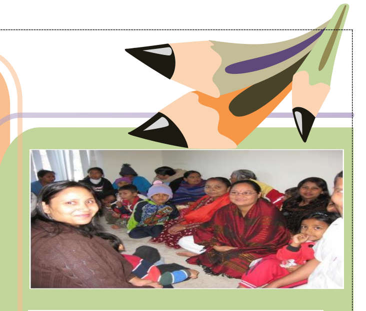
Bhutanese Refugees in Dallas Texas