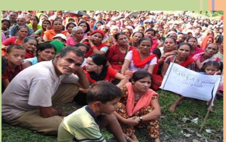
Bhutanese Refugees in Nepal